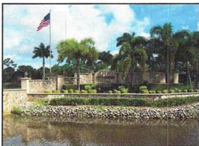
Cross Creek Country Club 2 br condo, includes golf $69,000. Wow!

Lawrence Yun, NAR chief economist says "Even with market frictions related to the mortgage process, home contract activity continues to improve. Home sales are recovering now based solely on fundamental demand and favorable affordability conditions."